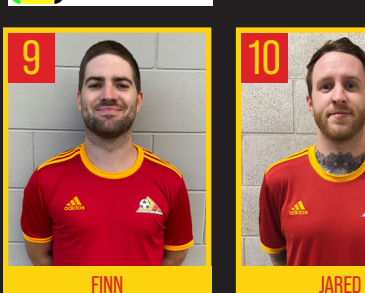
SPONSORED BY (GO) MEDIA