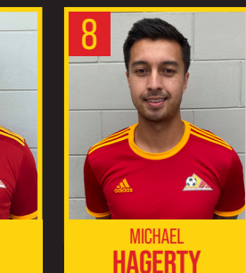
SPONSORED BY SPONSORED BY COMPLETE SWITCH