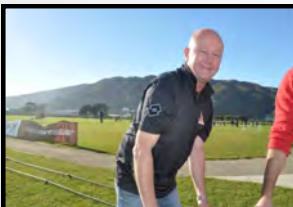
How many men does it take to put up a marquee?