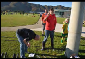
If all else fails read the instructions!