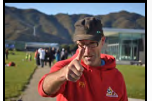
5 hours later... It's done!