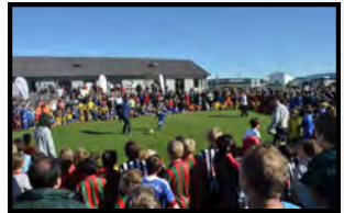
A huge crowd enjoyed the day