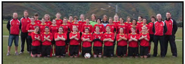
Stop Out Women's squad of 2010

NME Electrical - Supporters of Stop Out Women