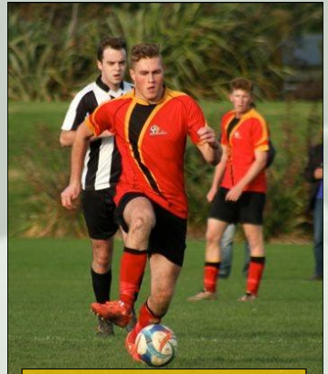
Debut and start for Devon