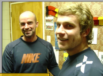
Signing for Stop Out, 2008