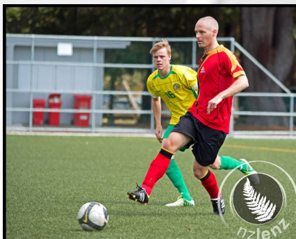
JT back to Captain the side in 2014.

See you in the clubrooms at full time. The beer is cold and the company's good!