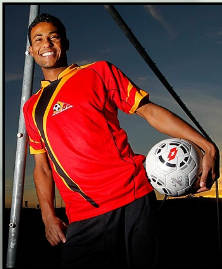
Man of the Match "Fizz"

In the lengthy injury time, Simon Conway came on and produced a great run and finish to wrap up the result and put us back on track.