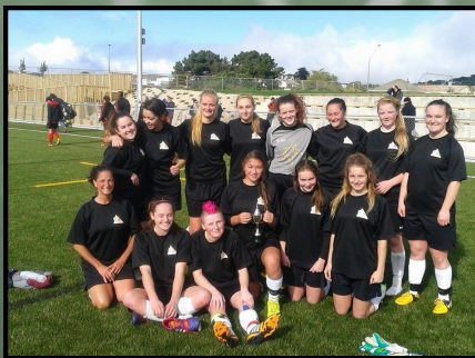
2014 Capital Premier Cup Winners