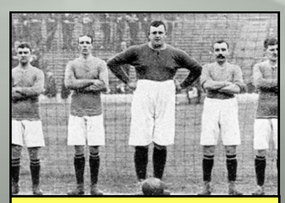
The Black's "Wall of Death" have conceded just seven goals all season.

Lenny has been decidely chipper over the last few weeks. The Blacks have steamrolled to the top of Masters 5 . A comprehensive thumping of Marist Classics last time out sees them atop of the league that matters most to them—the league McCreadies Clowns are in!