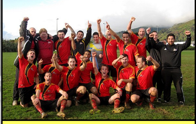
2013 Capital Premier Champions!