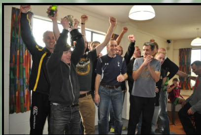
And so are the Reds!