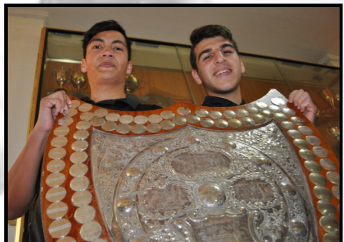
Ages combined - still younger than JT!