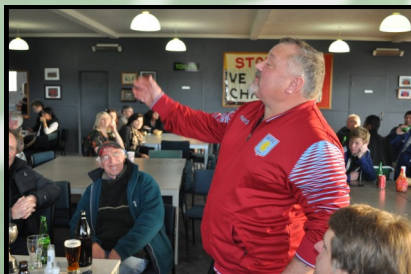
After 18 years, the Blacks are Champs!