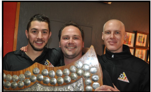
Coach, Captain and some other guy!