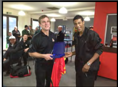
Great mate Fizz presents the shirt