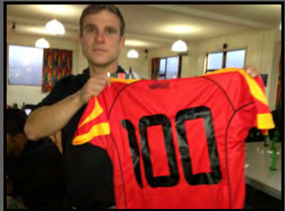
Steve's commemorative shirt